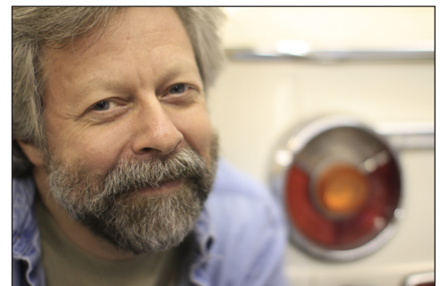
Author Rob Siegel

Price: $29.95 Softcover, 6 in. x 9 in. 432 pages 37 photos Bentley Stock Number: GBRS ISBN: 978-0-8376-1720-6